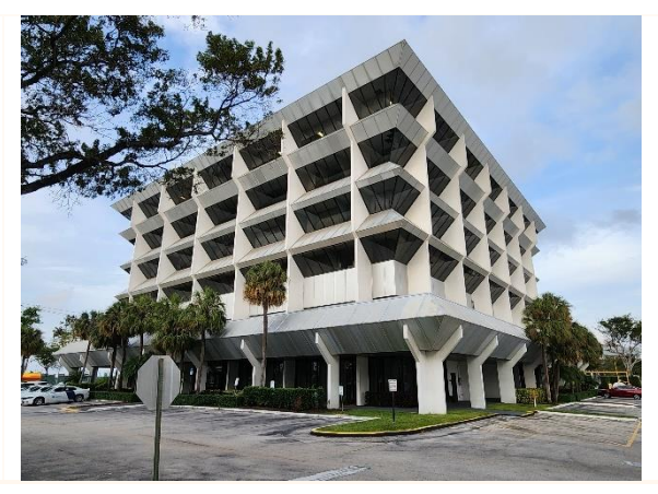
Simon Property Group (SPG) Aventura Mall, Hollywood, FL – 1 March 2024