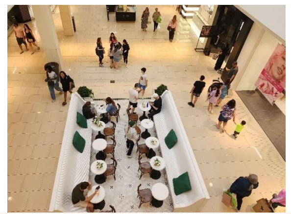
Apartment Investment & Management Co. (AIV), Hollywood, FL – 3 March 2024