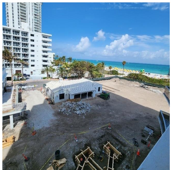
RLJ Lodging Trust (RLJ) Tour, Miami, FL - 3 March 2024